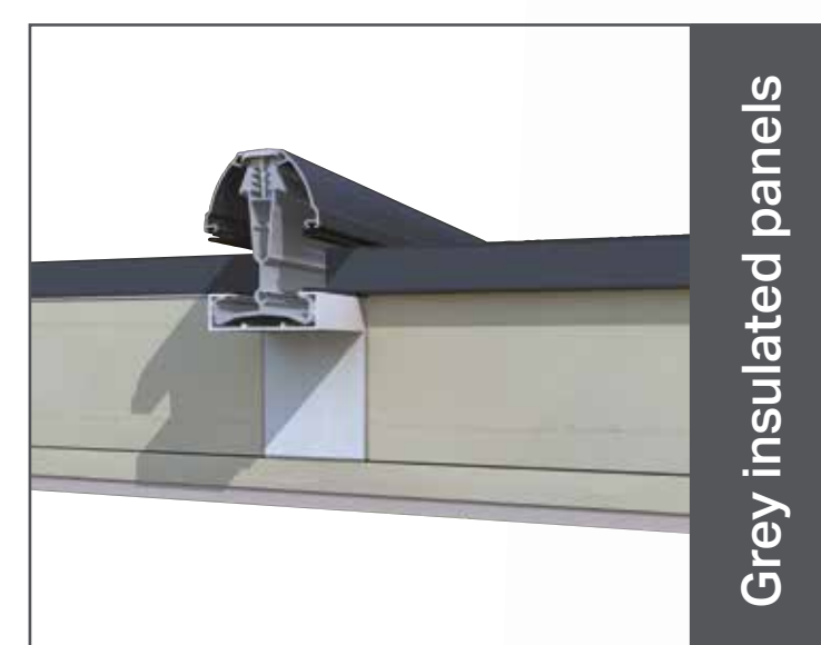
Grey insulated panels

Grey aluminium insulated panels provide a U-Value of 0.16 and reduce heating bills